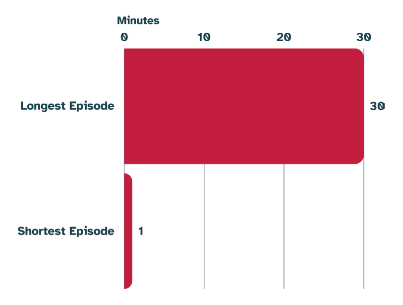
Figure 4: Physical Restraint Duration

The MHC implemented new Code of Practice on the use of Physical Restraint in January of 2023. In accordance with this code, Ginesa Suite has been reviewing each episode of Physical Restraint to determine compliance and the approved centres own policy. Overall compliancy with the Code and the approved centres policy is noted below.